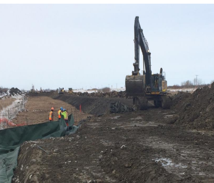
772 +200 SK 909 Class V Ramp removed