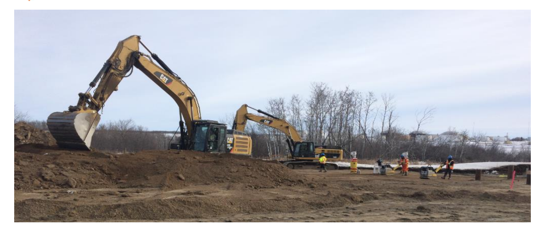
805 + 300 MLBV #23A Backfilled and packing.