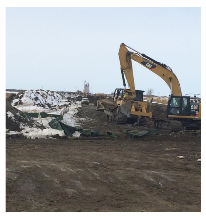
772 + 700 SK 908 Class IV Ramp removed