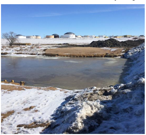
805 + 600 The Pipestone Creek MB 1010